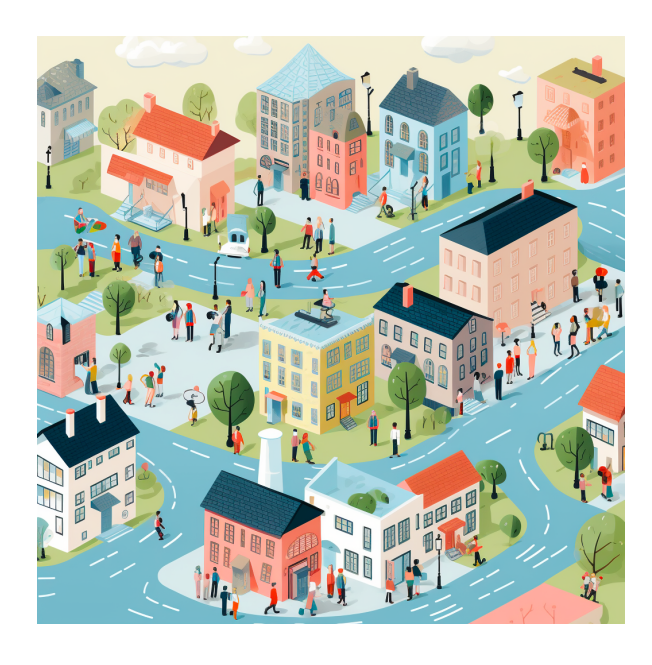
How to Prioritize Community Projects for a Capital Improvement Bond Package